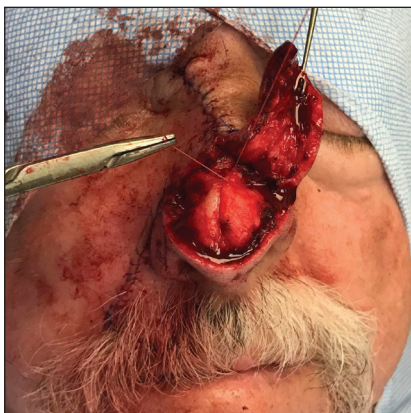
FIGURE 2. Simple interrupted sutures placed into the nasal cartilage to narrow the nose.

Cartilage sutures highlight an underutilized technique in nasal reconstruction, with few cases reported in the dermatologic surgery literature. 3,4 The interdomal suture is placed through the left and right lower lateral cartilages to help narrow and redefine the nasal tip. 5 Reported techniques include simple interrupted suture or horizontal mattress suture. Suture material for nasal cartilage may be permanent (nylon or polypropylene) or long-lasting